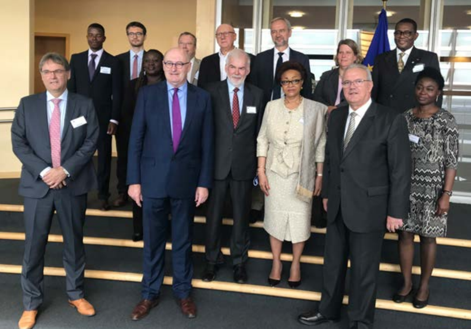
First meeting of the Task Force Rural Africa on 24th May 2018 with Commissioners Josefa Leonel Correia Sacko, Neven Mimica and Phil Hogan