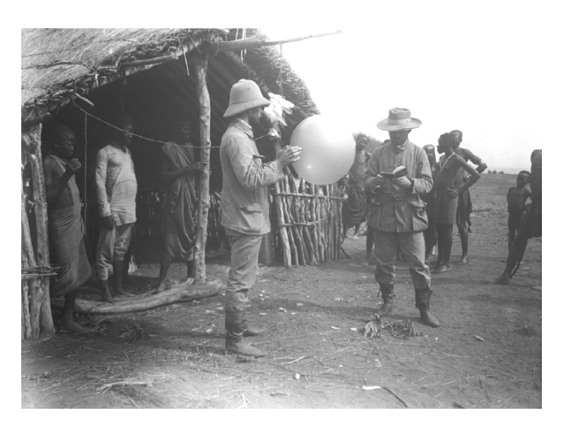
FIGURE 2 Colonial data form part of current products on which decisions are based. German aerologists in the East African colonies in 1908, measuring vertical wind profiles using balloons (Brönnimann and Stickler, 2013)

Third, climate data products carry imprints of social, political and economic contexts, which should not be dismissed as irrelevant or nonexistent. As an example, we can examine development cooperation. Early colonial climate data (see Fig. 2 for an example) contributed to shaping world views, depicting the tropics as an imagined space and to the notion of environmental determinism (Livingstone, 1999; Mahony and Endfield, 2018). They were an instrumental part of colonialism. Although the measurements themselves do not convey attitudes, some of these data, influencing our decisions today, still carry colonial roots. By producing full-coverage data products of past climate and analyzing climate processes over the former colonies, western science today has to be careful not to ,,re-colonize" their atmosphere (Gregory, 2001). Being aware of data histories may sensitize for this aspect. Despite the enthusiasm for open data in so-called developing countries, questions of data policy, ownership, co-authorship, and location of data holdings should be discussed under this point of view. For instance, precipitation data based on mobile communication links seem promising for developing countries (Tollefson, 2017), but might raise proprietary concerns.